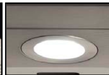
0.5W LED lights